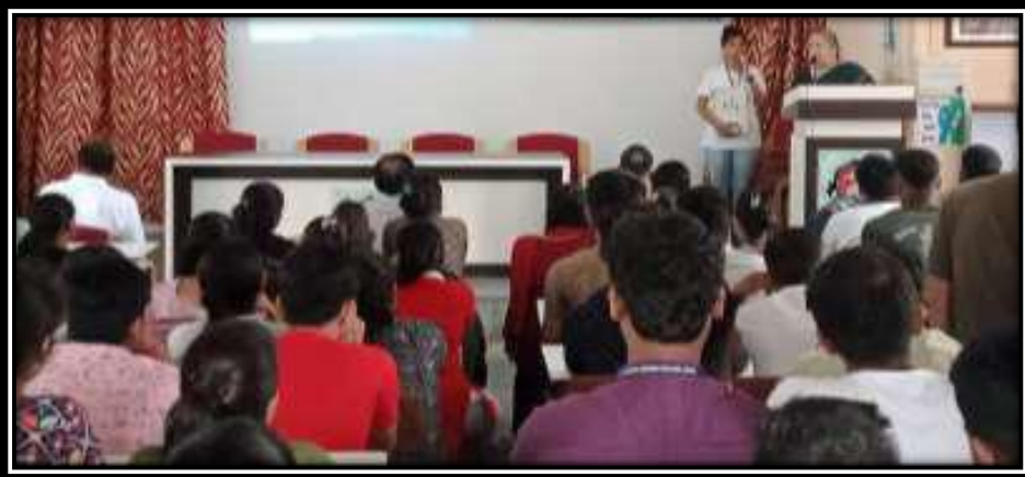
Senior teachers addressing students