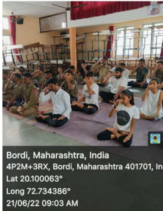
Bordi, Maharashtra, India 4P2M+3RX, Bordi, Maharashtra 401701, In Lat 20.100063° Long 72.734386° 21/06/22 09:03 AM