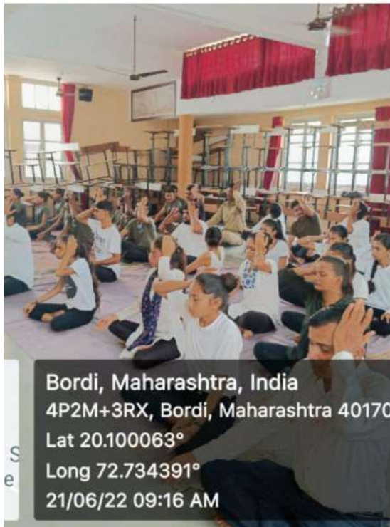
Bordi, Maharashtra, India 4P2M+3RX, Bordi, Maharashtra 40170 Lat 20.100063° Long 72.734391° 21/06/22 09:16 AM